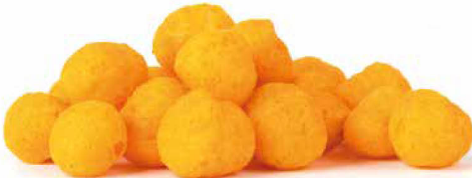
PUFFS / BALLS