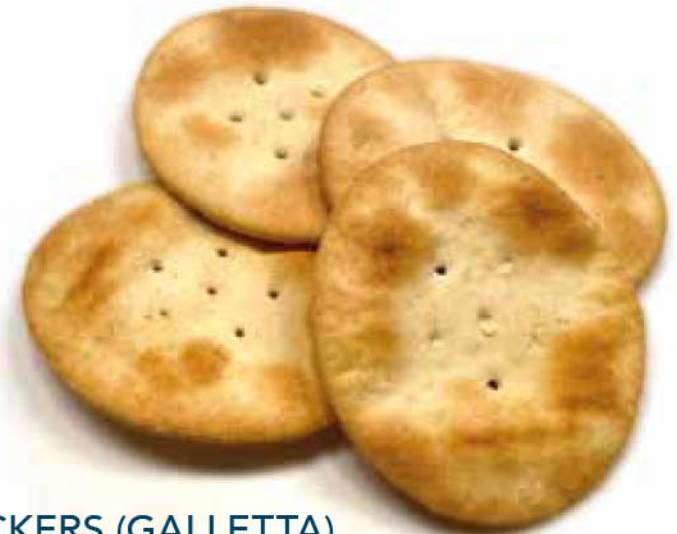
WATER CRACKERS (GALLETTA) Low Fat Flavoured Water Cracker