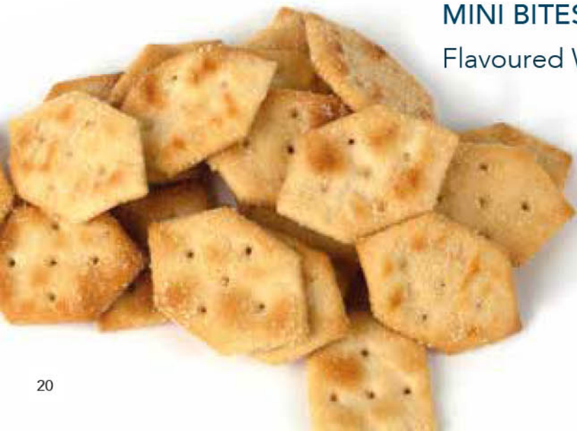
MINI BITES Flavoured Wheat Crackers