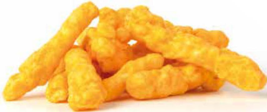
CRUNCHEES (CRIX STYLE) Gluten Free Baked Snacks