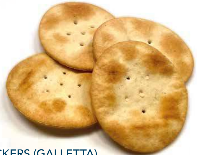
WATER CRACKERS (GALLETTA) Low Fat Flavoured Water Cracker