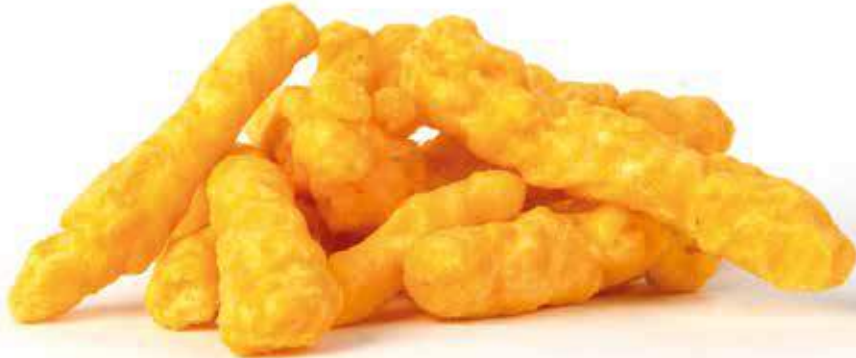
CRUNCHEES (CRIX STYLE)