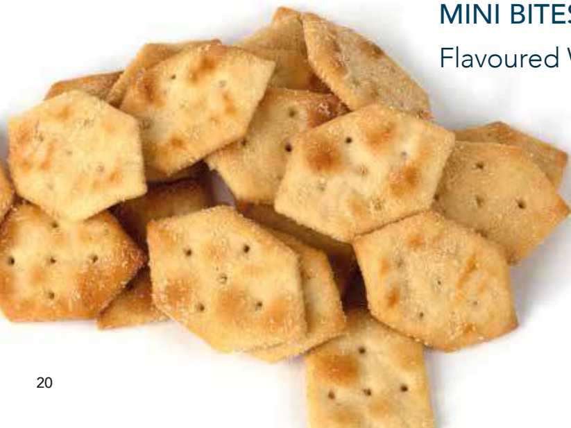
MINI BITES Flavoured Wheat Crackers