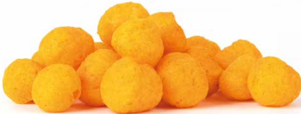
PUFFS / BALLS